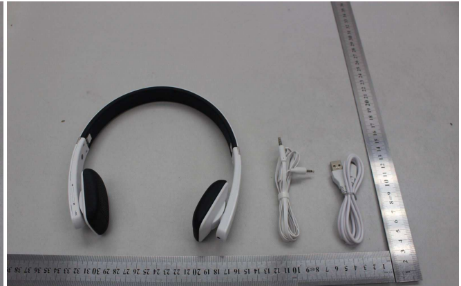
Report Number (9317)104-0589