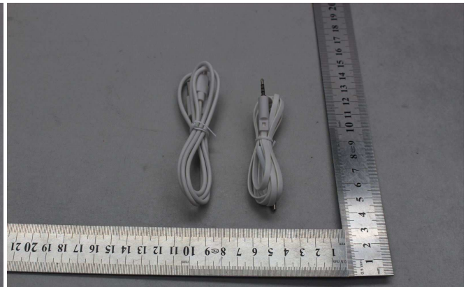
Report Number (9317)205-0897