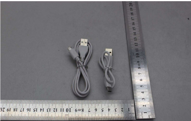
Report Number (9317)104-0589