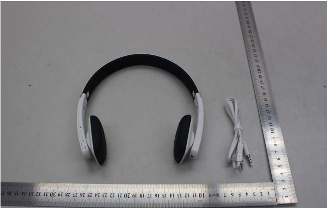
Report Number (9317)104-0589