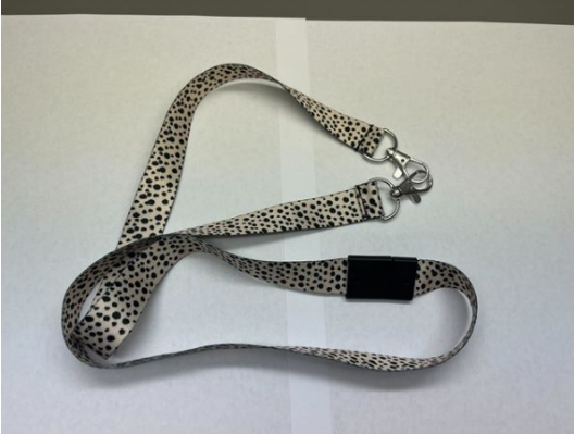
Product (provided by client)